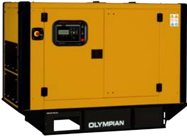
Enclosure pictured may include optional accessories